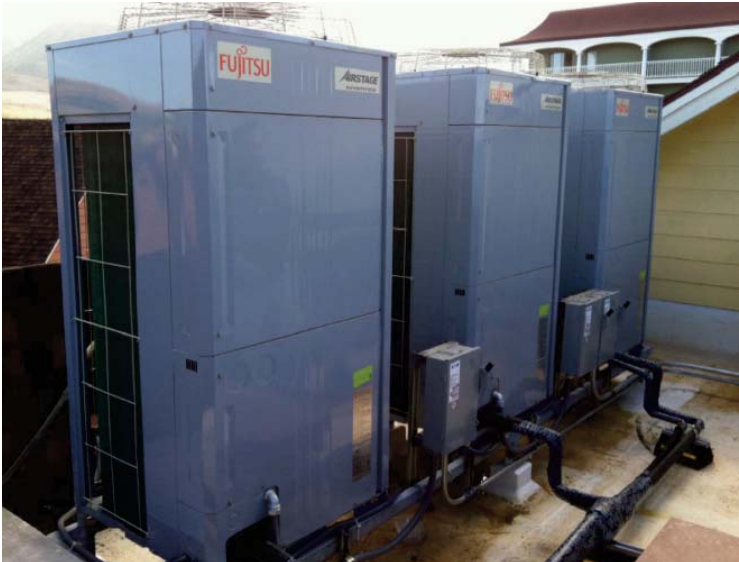
The units were coated for salt water protection. That included the sheet metal, giving it a grey color.