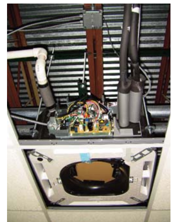
With access to all system components on the same side, servicing Fujitsu VRF systems is a breeze.