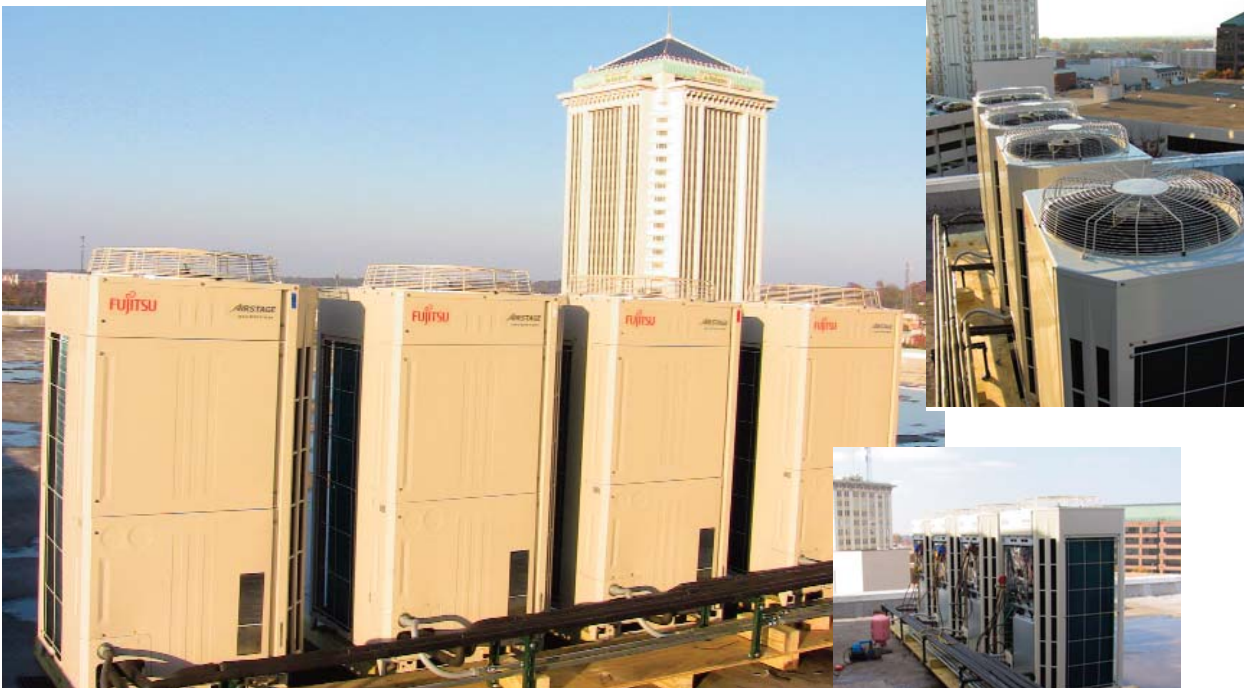
There are 4 systems totaling 30 tons installed on the project.